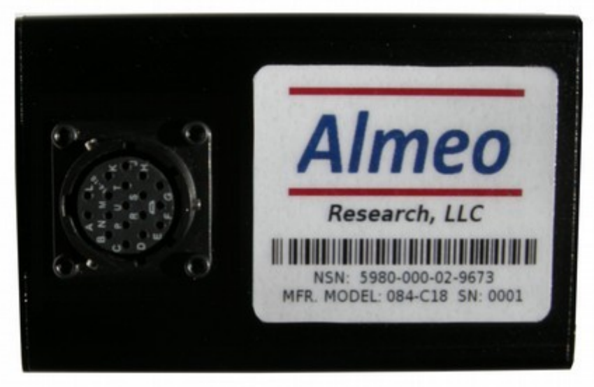
Front view of XIIP card. (103 mm long x 66 mm wide x 27 mm thick not including connector.)

Solution: An electronics module that measures fuel consumption in real-time but, also measures indicated mean effective pressure (IMEP) and engine speed. The two variables of load (IMEP) and speed can serve as a frame of reference for the meaningful comparison of test and baseline measurements. The J1321 standard describes a rationale for evaluating the performance of this normalization. The same rationale could be applied to the XIIP normalization procedure. It may turn out that the XIIP normalization is better since it is easier to collect much larger amounts of data on a single vehicle under typical service conditions.